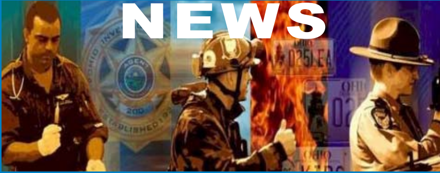
Bob Taft, Governor